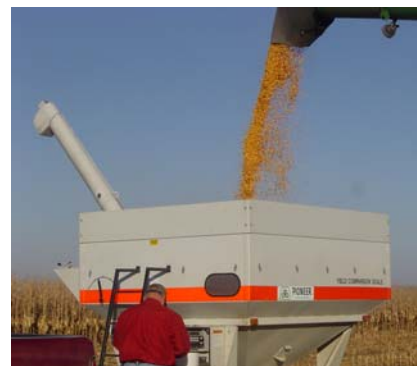
On November 10th the test plot was harvested, the initial yields look promising.

After taking out the test plot, the class was very pleased with the results. More than fifty varieties from eight different companies were grown in the test plot. All of the seed for the test plot was donated in the spring. Local Pioneer dealers Ron Finch and Bob Lund donated their time to come out and weigh the hybrids for the farm. The yields ranged from 215 to 259 bushels an acre, moisture ranged from 13 to 16 percent, and test weight was excellent with most of the corn above 58 pounds.